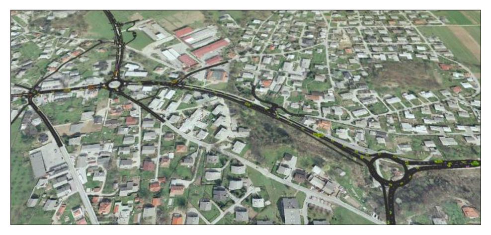
Figure 1 Microscopic simulation made by PTV Vision: VISSIM

SSAM was developed in "Turner-Fairbank Highway Research Center" (McLean, Virginia, US) in association with FHWA (US Federal Highway Administration) and Siemens Energy & Automation (Tuscon, Arizona, US). This tool determine the frequency and type of conflict points. As already mentioned, SSAM major advantage is that it allows traffic safety analysis of the planned road infrastructure before building it. It is also very useful when making comparative analysis [3].