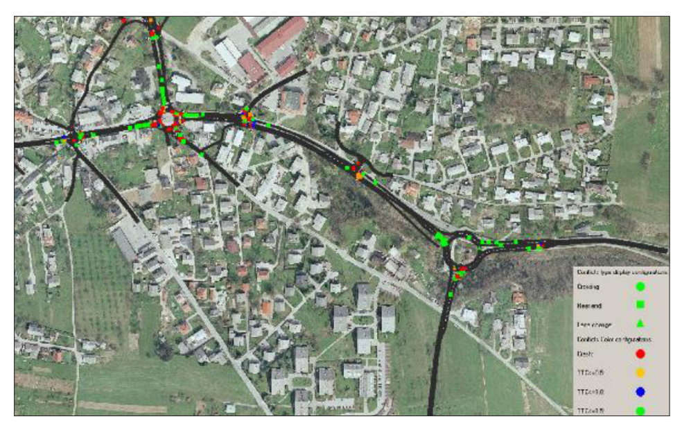
Figure 4 Visualization of conflicts

Figure 4 below represents example of static visualization as exported picture made by SSAM. Conflict icons are colour coded according to their time-to-collision values.