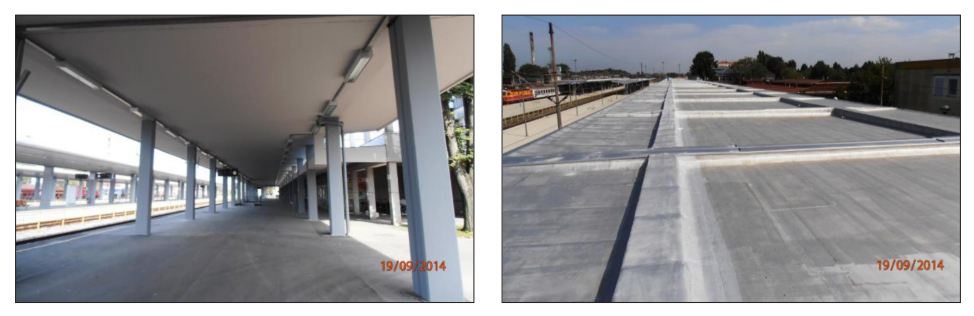
Figure 9 Shelter on the 1st platform and the view after reconstruction