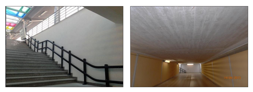
Figure 5 Ramp for the disabled persons and the pedestrian underpass of the railway station Slavonski Brod