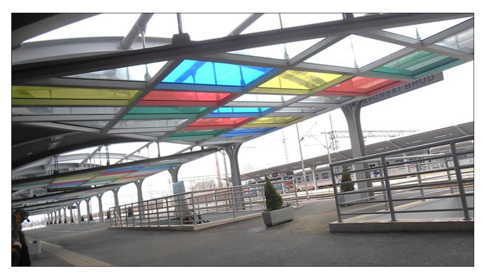
Figure 6 61st platform of the railway station Slavonski Brod after reconstruction