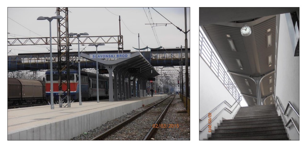
Figure 4 2<sup>nd</sup> platform of the railway station Slavonski Brod after the reconstruction