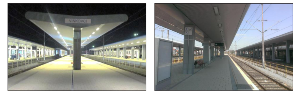
Figure 7 Railway station Vinkovci after reconstruction

During execution of works, the passenger and freight transport operations in the railway station Vinkovci took place nonstop. During execution of works on 3<sup>rd</sup> platform, the transport operations took place along the 1<sup>st</sup> and 2<sup>nd</sup> platform. When the works on 3<sup>rd</sup> platform were completed, while the works were carried out on 2<sup>nd</sup> platform, the 3<sup>rd</sup> platform was temporarily put into operation and, together with 1<sup>st</sup> platform, was used for the passenger reception and dispatch. After the works were completed, all three platforms were operating, regardless of the fact that the technical inspection and issuance of the usage permit took place much later.