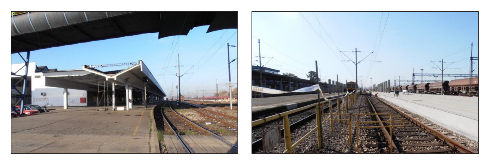
Figure 3 Railway stations Slavonski Brod and Vinkovci in the initial phases of reconstruction