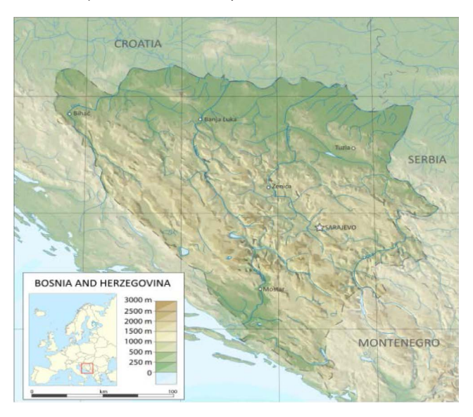
Figure 1 Map of Bosnia and Herzegovina

this Introduction provides more basic facts on the historical development of railways in BiH. The railways today remain a significant economic asset of BIH's economy and railway transport is still essential for operation of big industrial systems (e.g. power plants, steel factory, aluminium factory etc.). In addition, the railway system is connected to the Port of Ploče in Croatia in the south and the European railway network in the north, providing perspective for all export oriented companies in the country. The second subheading gives a brief review of BiH railways institutional setup.