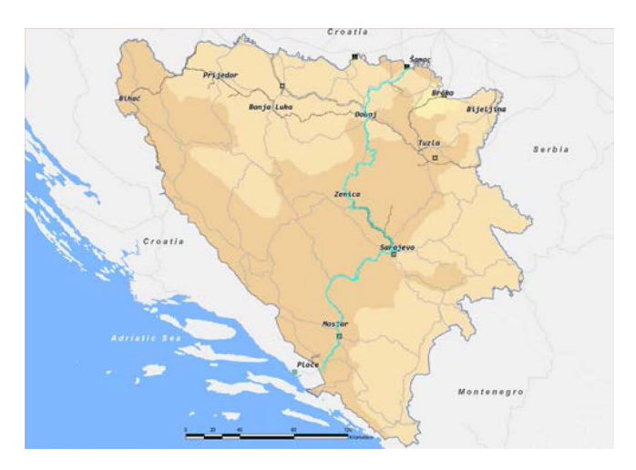
Figure 4 Railway lines in Corridor 5-c and BiH Core Transport Network