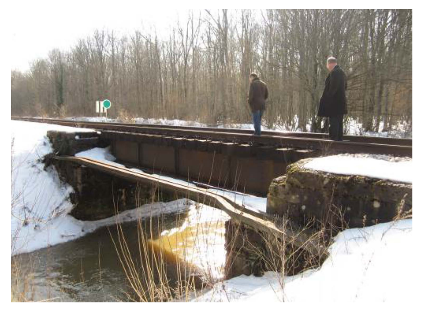
Figure 1 "Buna" bridge

"Buna" bridge, situated at the railways track M104 Novska – Sisak – Zagreb at km 398+422, is selected for the case study because of the obvious problems in the transition zones, immediately before and after the bridge. In the transitions zones irregularities in the geometry have been noticed, such as track unevenness and under ballast gaps, and vertical displacements of the whole track structure. These were caused by differential settlements and by dynamic impacts of the train due to the changes in the track stiffness. In order to detect the causes of degradation in the transition zones and also to perform the appropriate reconstruction of the same area it was necessary to collect all the information's about the existing embankment and foundation soil.