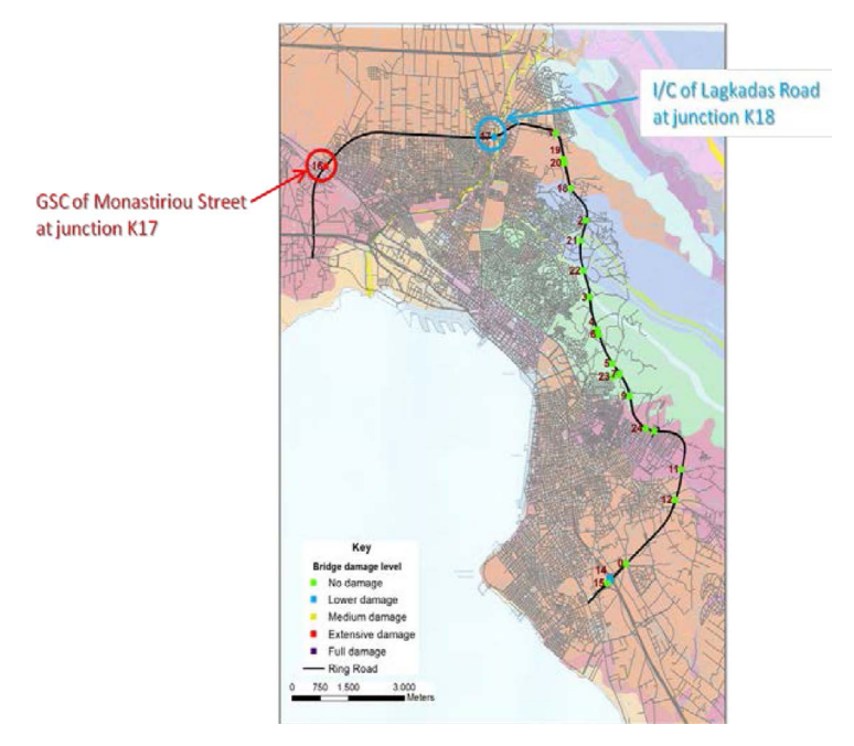
Figure 2 Visual representation of locations and bridge damage level on the Inner Ring Road Using the BDI and LDI indices:

The purpose of the study was to identify the anticipated seismic damage to Thessaloniki bridges; to this end, only two bridges were examined, those being the ones presenting the highest levels of damage for the basic earthquake scenario with a mean recurrence interval of T_m =475 years, as shown in Figure 2. Specifically, the GSC of Monastiriou Street at junction K17 was assessed to sustain extensive damage (BDI equal to 0.85), while lower damage is expected at the I/C of Lagkadas Road at junction K18 (BDI equal to 0.1).