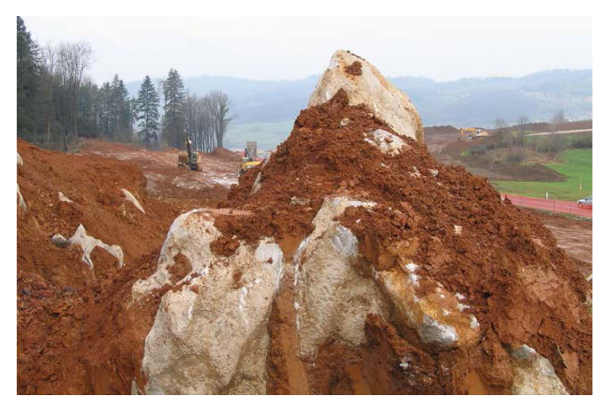
Figure 3 Pointed top of narrower pillar

The subsoil stone forests are composed of a dense network of more or less thickset and pointed pillars, which reach up to 8, sometimes even 10 metres, although most are lower. The narrower pillars with a diameter of one to two metres have sharp or rounded spire, while the thickest ones reaching up to ten metres (Fig. 3) in width have one or more spires or their tops are composed of more or less curved crests. Among them in most parts are funnel mouths of the perpendicular subsoil channels or horizontal subsoil channels.