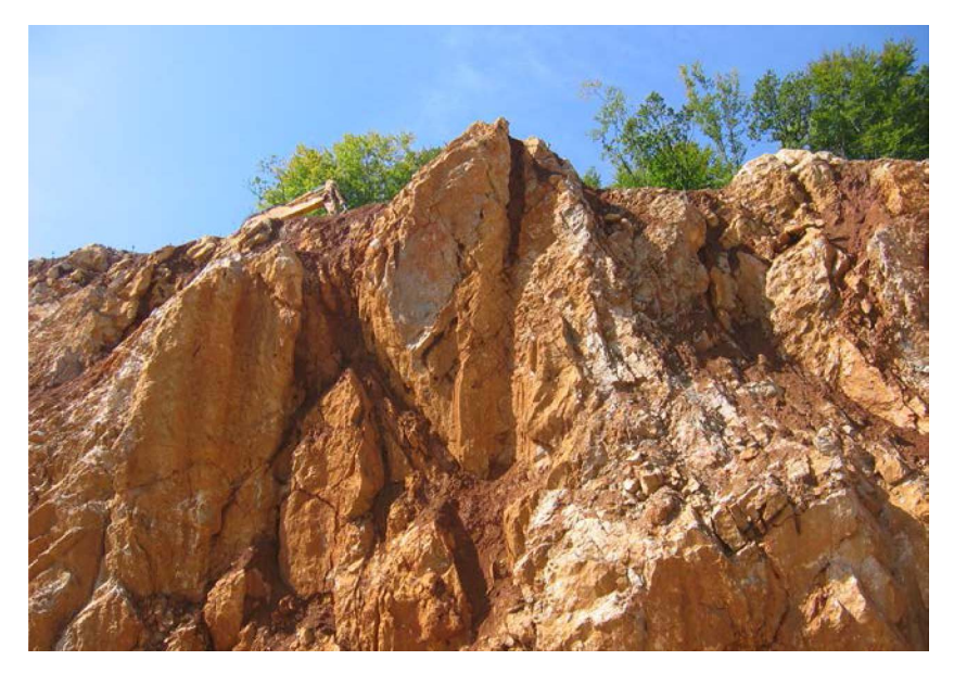
Figure 4 Subsoil channel

Close below the surface where the rock is covered with soil the rock surface of the stone pillars is relatively smooth, while deeper, at the connection with the sediment that covers the surface, it is coarse and often has a configuration of rounded pendants. The rock there is weathered. The thickness of the weathered layer measures up to 1 cm. It is soft when moist, but as it dries out after being exposed on the surface for a longer period and the water evaporates from it, it hardens. The state of weathering of the top layer of the rock is the result of the connection with the sediment, which is moist most of the time. The connection is relatively less permeable, and the water that does permeate it only slowly washes the solution. The connection with more permeable soil is correspondingly also more permeable.