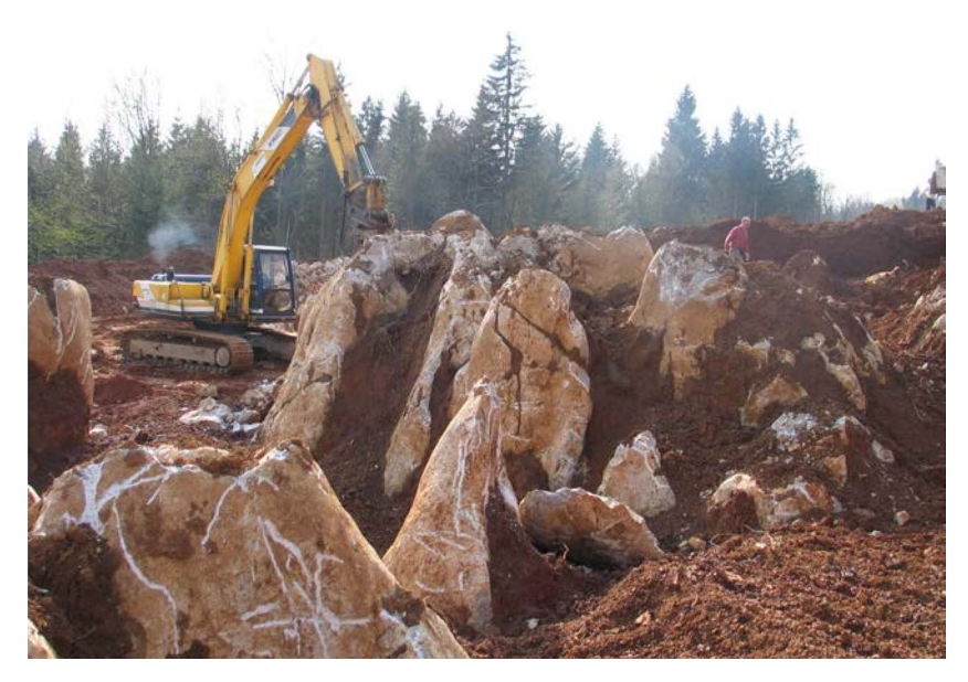
Figure 1 Uncovering of subsoil stone forest