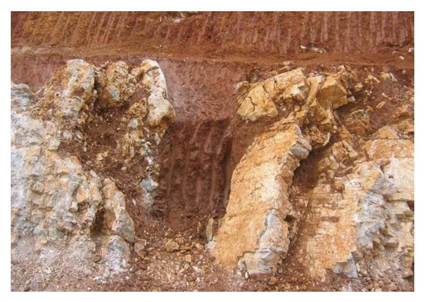
Figure 5 Subsoil shaft along fault

shafts are formed at local dense flow of larger quantities of water. They can develop from subsoil channels. Their walls are carved with along-sediment rock features, which are the traces of formation at the connection with fine-grained sediment. With greater permeability in the karst interior, the subsoil shafts can be emptied.